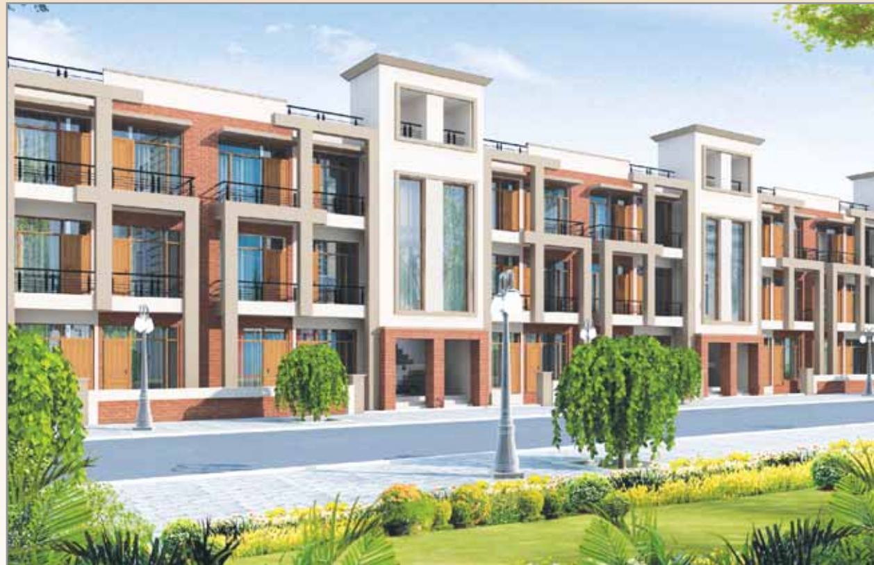
Platinum Homes, TDI City, Sector 118, Mohali