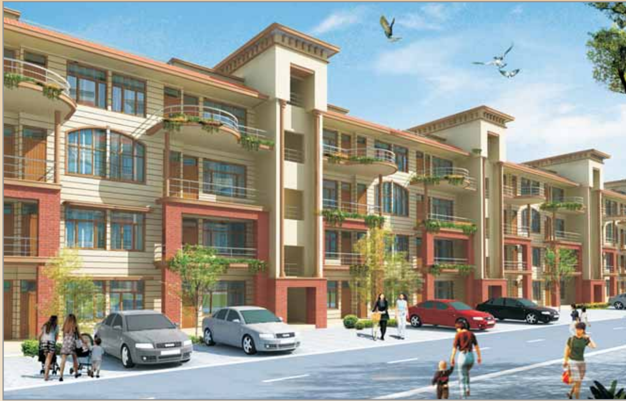
Cozy Homes-2, Sector 116, Mohali