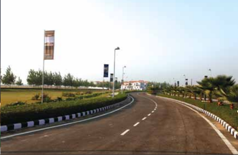
MAIN SPINE ROAD